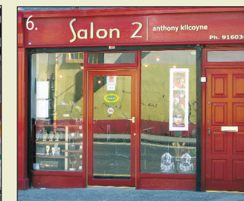
1. Finuala's Hair Design; 2. Flair Hair Design; 3. Lydia Murrays Hair & Beauty; 4. Oasis Hair Design; 5. Rossano Hair Design; 6. Salon 2.